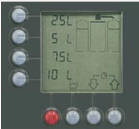
The convenient control panel with LCD display makes it easy to adjust and read settings.

Do you require large quantities of delicious fresh filter coffee, brewed quickly? Then Bravilor Bonamat's round filter machine is the solution. The range is ideal for busy periods where high volumes of coffee are demanded, such as theatre intervals or hospital canteens. The containers can be placed in almost any location with ease allowing coffee to be served at any moment wherever you wish. The machines come equipped with user friendly programming and in an attractive design: the robust stainless steel appearance confirming the quality of this equipment.