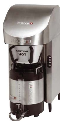
Mini Filtro Shuttle