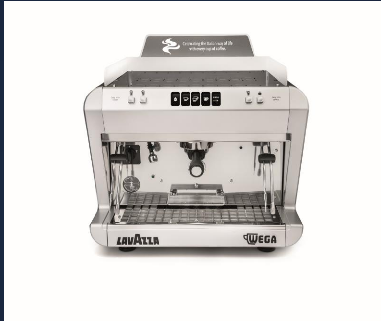
UPDATED DESIGN INNOVATIVE AND REFINED LINES, STAINLESS STEEL ON THE FRONT SIDE AND ABS SHELL