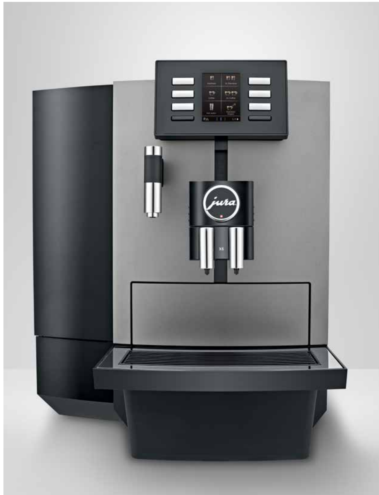
X6 The robust professional solution for black coffee and water for tea